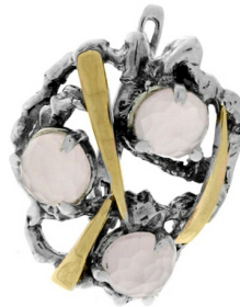
Silver and Gold Earrings $ 70.87