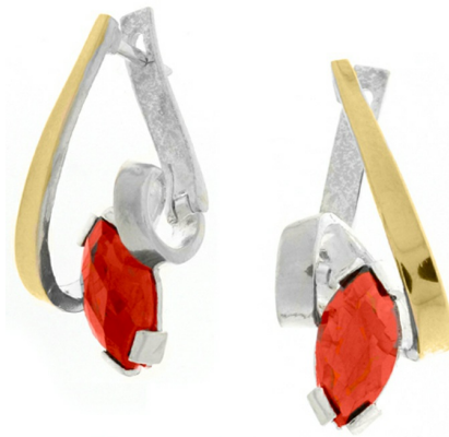
Silver and Gold Earrings $ 29.13