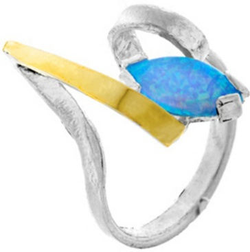
Drop of water $ 23.91