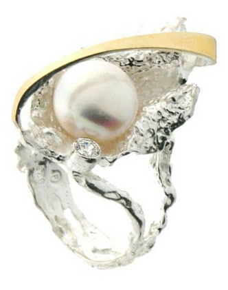
Pearl in a shell $ 39.13

You can comfortably purchase with Simenda Jewellery and receive a True Two tone Silver & Gold Jewellery at a decent price.