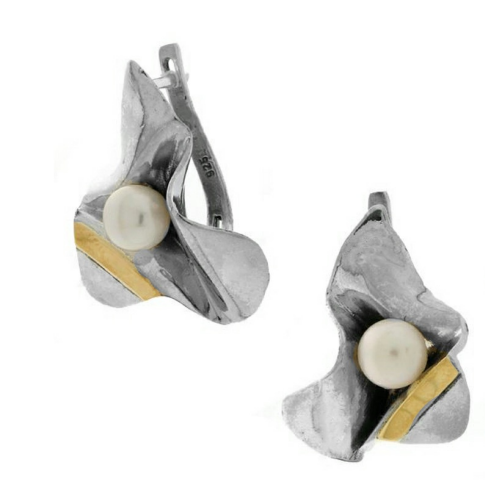
Silver and Gold Earrings $ 52.17

You can comfortably purchase with Simenda Jewellery and receive a True Two tone Silver & Gold Jewellery at a decent price.