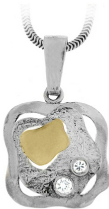
Silver and Gold Pendant $ 16.09