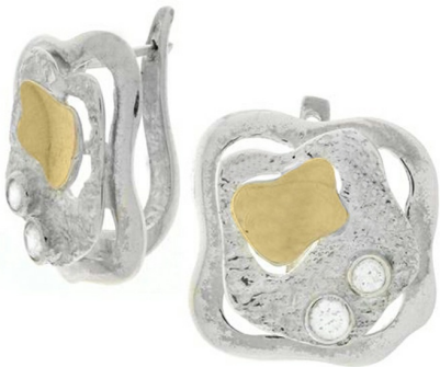
Silver and Gold Earrings $ 29.13