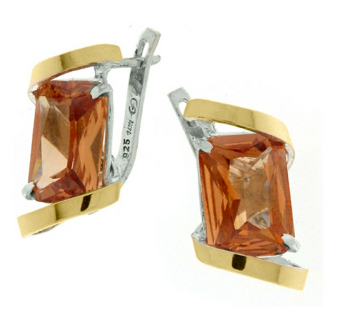
Silver and Gold Earrings $46.96