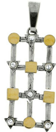
Silver and Gold Pendant $ 22.17