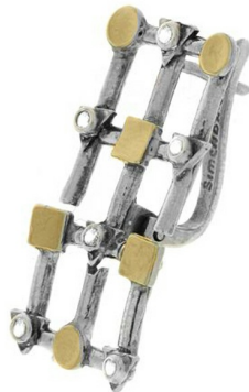
Silver and Gold Earrings $ 44.78