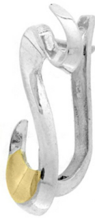
Silver and Gold Earrings $ 26.09