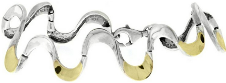
Silver and Gold Bracelet $ 65.22