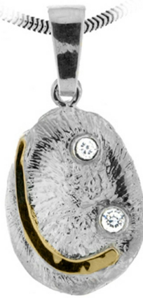
Silver and Gold Pendant $ 14.78