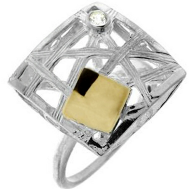
Silver and Gold Ring $ 17.83