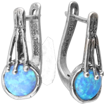
Silver Earrings $ 16.00