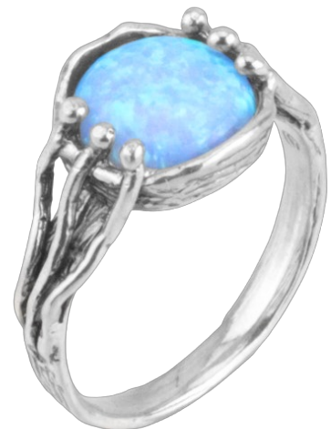
Silver Ring $ 12.00