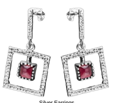
Silver Earrings $ 16.00

Purchases at our site are fast, secure and hassle free. When shopping at Simenda Jewellery you are not compromising for mediocre half finished product, you are buying a piece of art made by very skillful craftsmen at a great price.