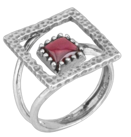
Silver Ring $ 15.00