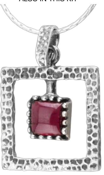
Silver Pendant $ 12.00