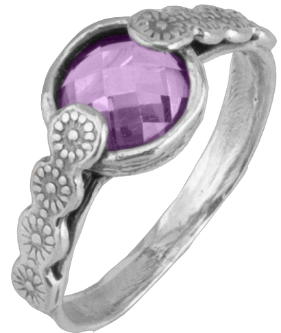
Silver Ring $ 12.00