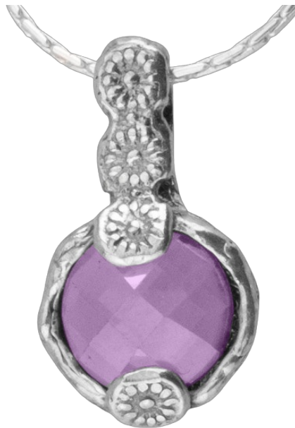
Silver Pendant $ 8.00