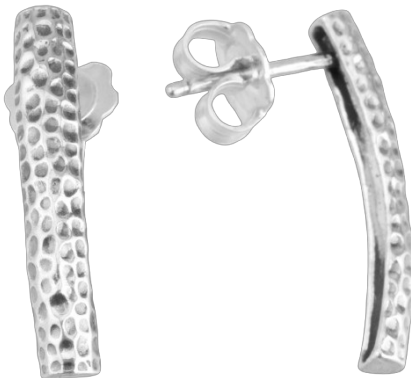
Silver Earrings $ 15.00