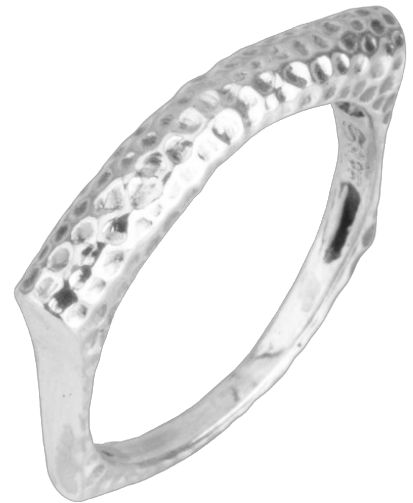
Silver Ring $ 12.00