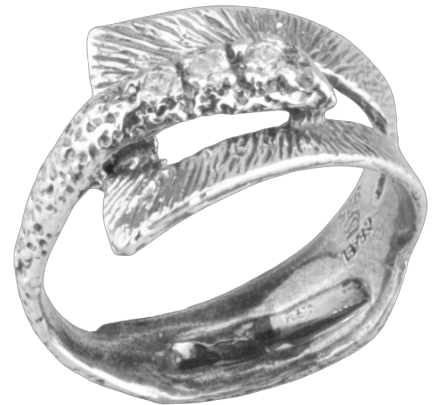
Silver Ring $ 15.00