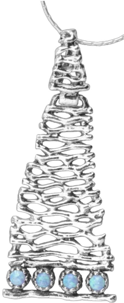
Silver Pendant $ 17.00