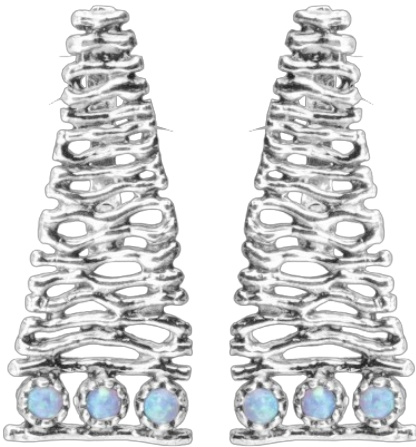
Silver Earrings $ 29.00