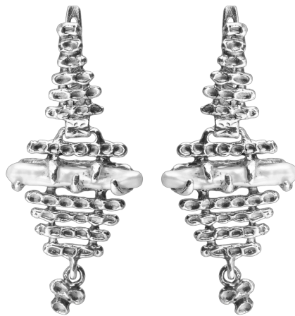
Silver Earrings $ 37.00