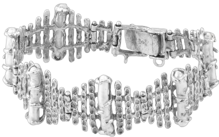
Silver Bracelet $ 110.00