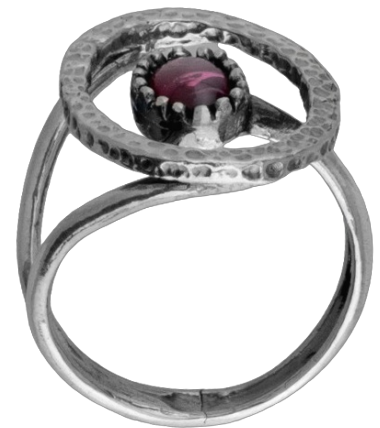
Silver Ring $ 16.00