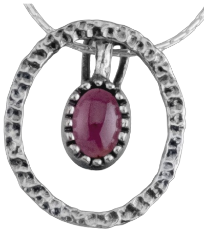
Silver Pendant $ 10.00