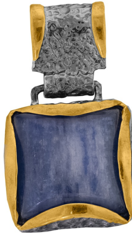
Gold Plated Necklace $ 69.00