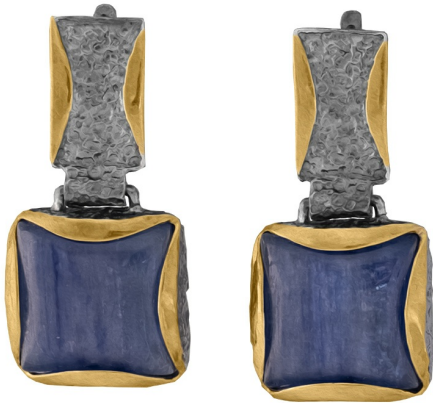
Gold plated Earrings $ 141.00