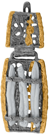
Gold plated Earrings $ 101.00