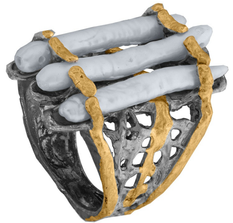
Gold Plated Ring $ 69.00