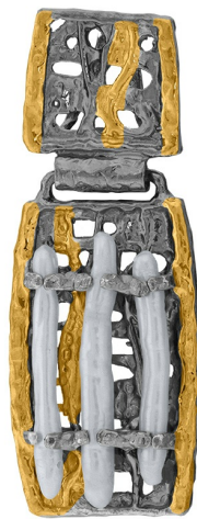
Gold Plated Necklace $ 67.00