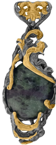
Gold Plated Necklace $ 50.00