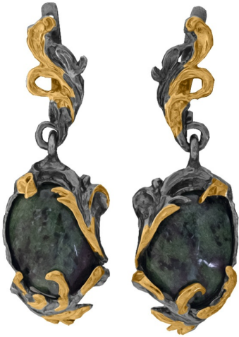
Gold plated Earrings $ 89.00