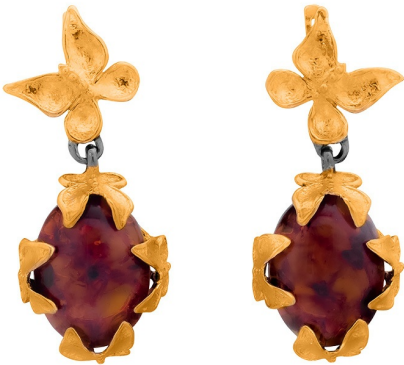
Gold plated Earrings $ 100.00