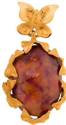
Gold Plated Necklace $ 67.00