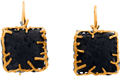
Gold plated Earrings $ 68.00