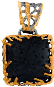
Gold Plated Necklace $ 70.00