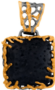
Gold Plated Necklace $ 70.00