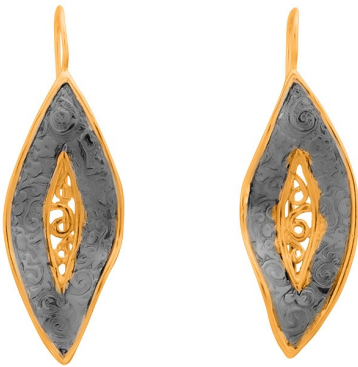
Gold plated Earrings $ 47.00