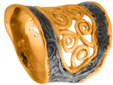
Gold Plated Ring $ 56.00