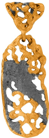
Gold Plated Necklace $ 46.50