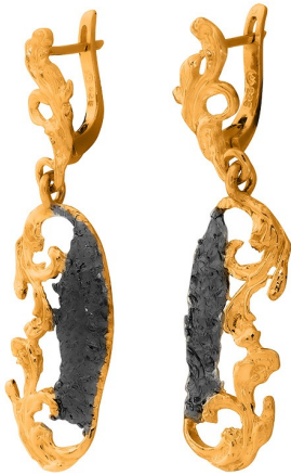
Gold plated Earrings $ 65.00