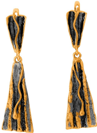
Gold plated Earrings $ 70.50