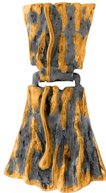
Gold Plated Necklace $ 35.00