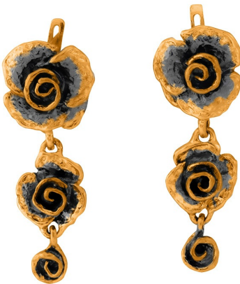
Gold plated Earrings $ 82.00