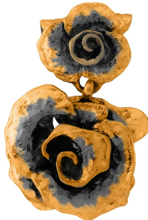
Gold Plated Necklace $ 91.00