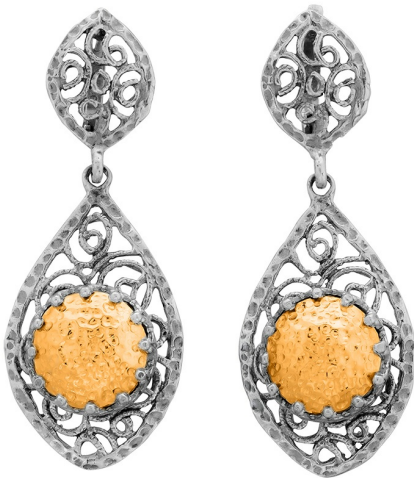
Silver and Gold Earrings $ 65.00