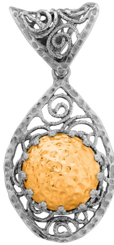
Silver and Gold Pendant $ 34.00