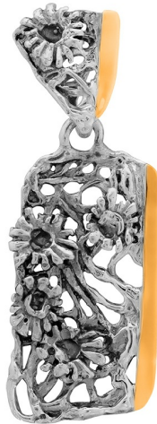
Silver and Gold Pendant $ 23.00