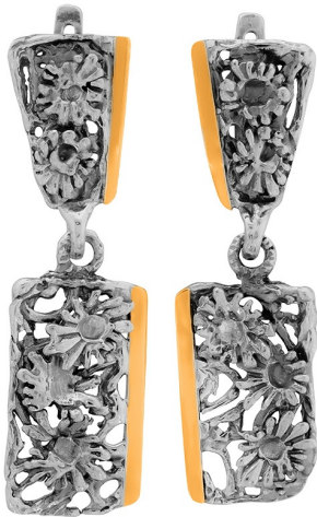
Silver and Gold Earrings $ 48.00