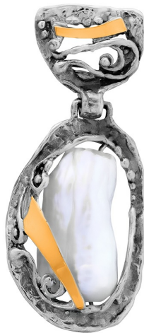
Silver and Gold Pearl Pendant "Aphrodite" $ 30.00