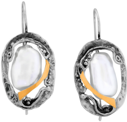
Silver and Gold Pearl Earrings "Aphrodite" $ 39.00