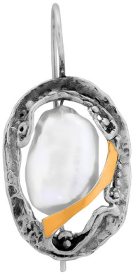
Silver and Gold Pearl Earrings "Aphrodite" $ 39.00