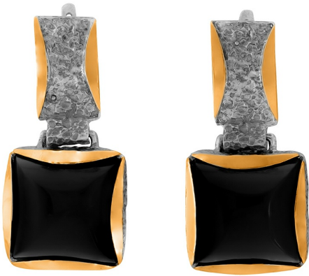
Silver and Gold Earrings $ 107.00