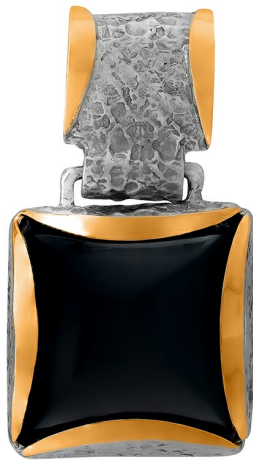
Silver and Gold Pendant $ 51.00