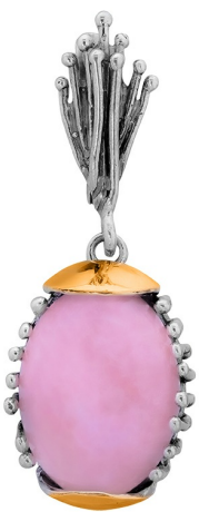
Silver and Gold Earrings $ 64.00