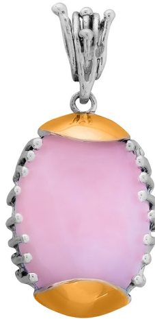
Silver and Gold Pendant $ 38.00