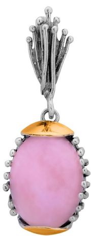
Silver and Gold Earrings $ 64.00