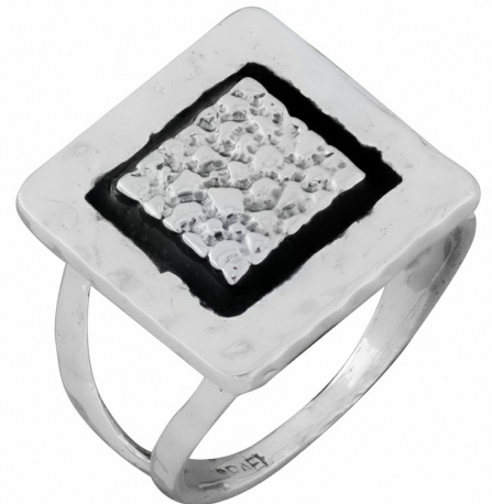
Silver Ring with Enamel $ 25.00