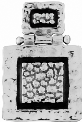
Silver Pendant with Enamel $ 17.00