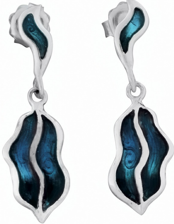
Silver Earrings with Enamel $ 20.00