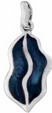
Silver Pendant with Enamel $ 9.00