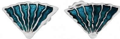
Silver Earrings with Enamel "Medusa" $ 15.00