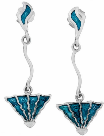
Silver Earrings with Enamel "Medusa" $ 19.00