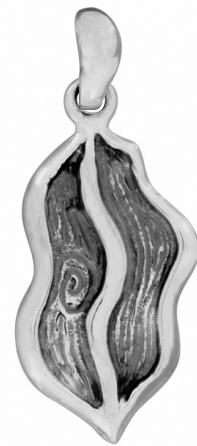
Silver Pendant $ 6.00