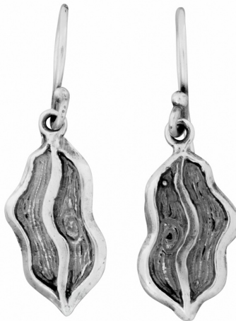
Silver Earrings $ 11.00