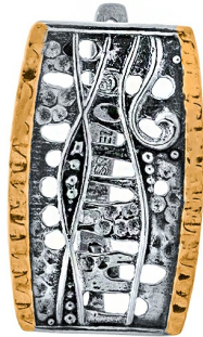
Silver Earrings $ 25.00