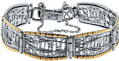
Silver Bracelet $ 75.00