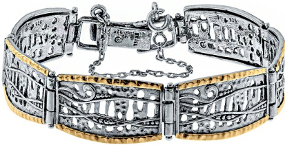
Silver Bracelet $ 75.00