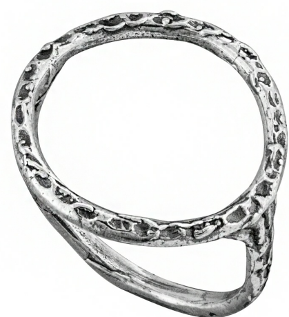
Silver Ring $ 10.00