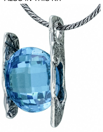
Silver Pendant $ 20.00