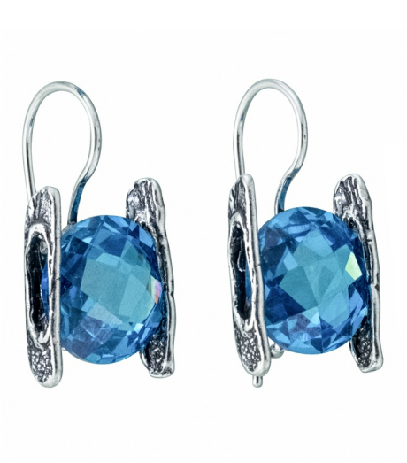
Silver Earrings $ 30.00

Purchases at our site are fast, secure and hassle free. When shopping at Simenda Jewellery you are not compromising for mediocre half finished product, you are buying a piece of art made by very skillful craftsmen at a great price.