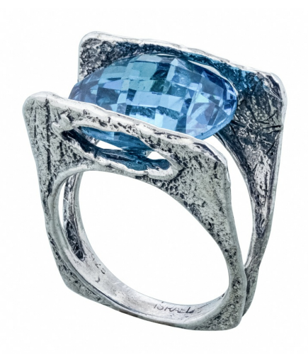
Silver Ring $ 27.00