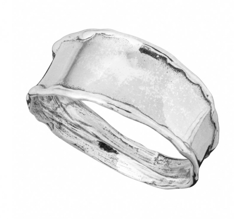
Silver Ring $ 10.00