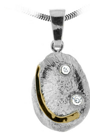
Silver and Gold Pendant $ 14.78