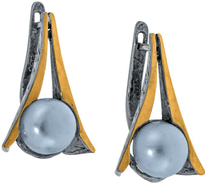
Silver and Gold Earrings $ 46.00