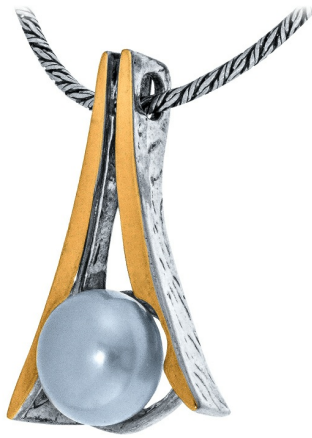
Silver and Gold Pendant $ 19.50