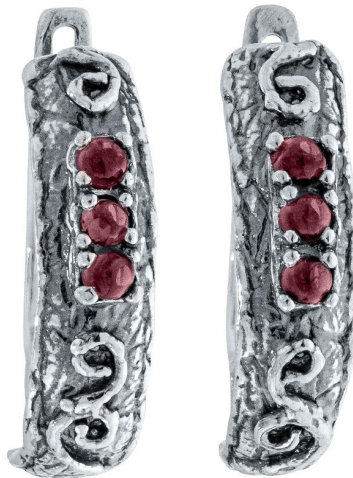
Silver Earrings $ 22.00