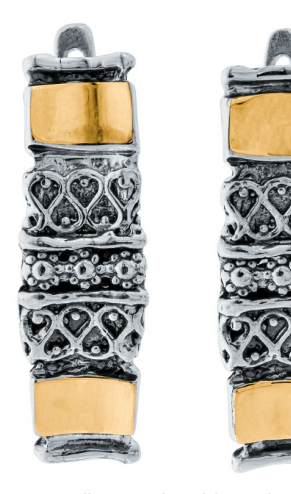
Silver and Gold Earrings $ 35.00

You can comfortably purchase with Simenda Jewellery and receive a True Two tone Silver & Gold Jewellery at a decent price.