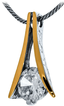
Silver and Gold Pendant $ 19.00