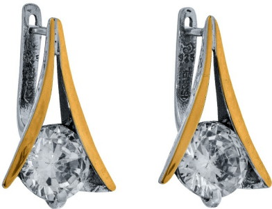
Silver and Gold Earrings $ 44.00