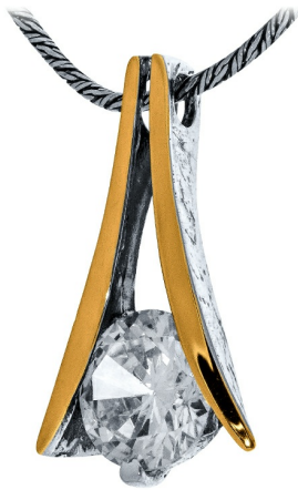
Silver and Gold Pendant $ 19.00